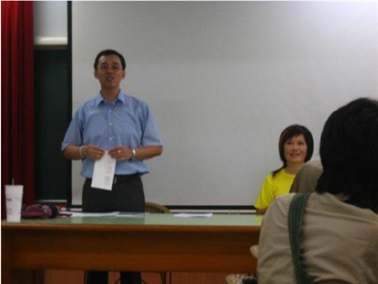
The principal of Tainan Municipal Shengli Elementary School instructing the campers

After another vigorous hour of Qigong exercise, the students prepared to leave for one of Taiwan's most famous attractions – the night markets. Here the students could try a variety of Tainan's scrumptious desserts and snacks ranging from the always popular bubble tea to more eccentric delicacies, such as barbecued squid. Students were also able to make purchases of many items ranging from clothing to sunglasses. After a unique night market experience, the students returned to KHGS to get a good night's sleep in preparation for the next day.