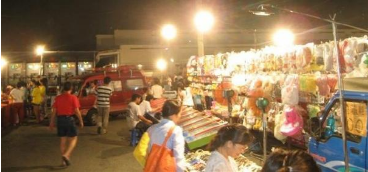
A view of the bright lights and merchandise available at the night market

On the next day, the high school students, armed with lesson plans and materials for the elementary school students, headed across the street to the Tainan Municipal Shengli Elementary School. For seven hours, students interacted with the elementary school students, sharing culture and exchanging smiles and laughs. "This experience was very rewarding," commented one high school student with a smile on his face. During break, the high school students had lunch with the Taiwanese volunteers and the elementary school students. The afternoon concluded with the students' meeting of the host families that would take care of them for the weekend.