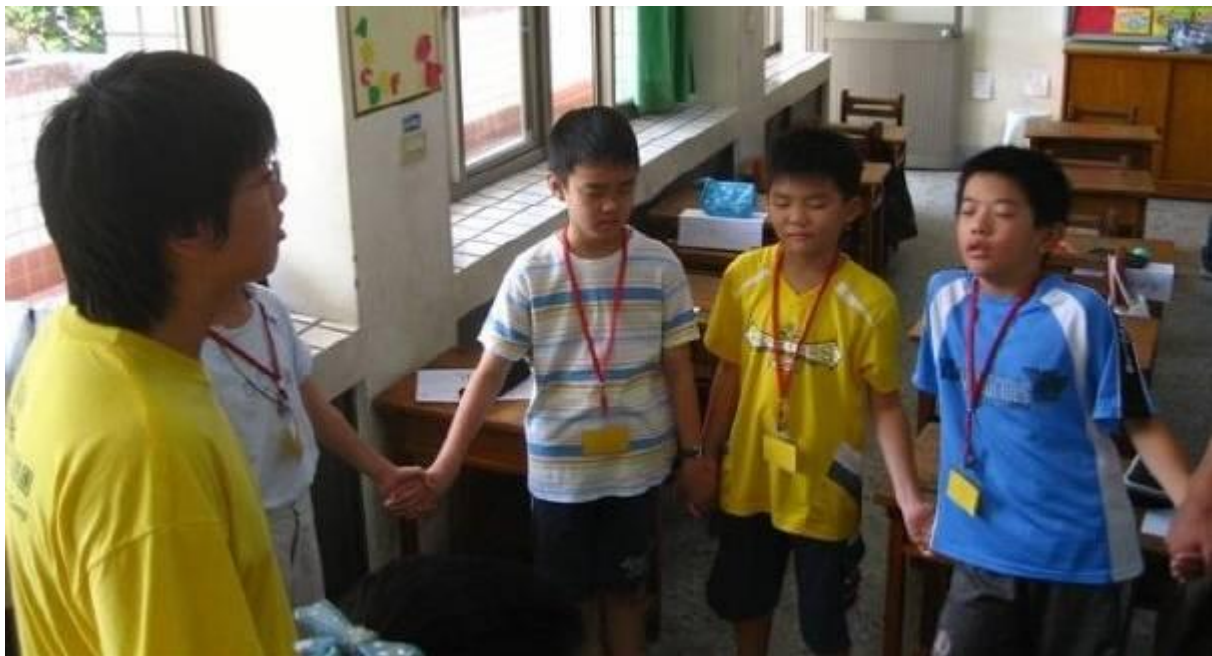
A high school camper leading the elementary school students in an icebreaker game

On the next day, the high school students, armed with lesson plans and materials for the elementary school students, headed across the street to the Tainan Municipal Shengli Elementary School. For seven hours, students interacted with the elementary school students, sharing culture and exchanging smiles and laughs. "This experience was very rewarding," commented one high school student with a smile on his face. During break, the high school students had lunch with the Taiwanese volunteers and the elementary school students. The afternoon concluded with the students' meeting of the host families that would take care of them for the weekend.