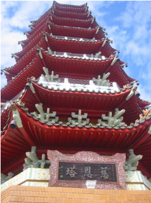
← the tower of Pagoda