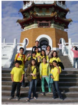
In front of the → Pagoda