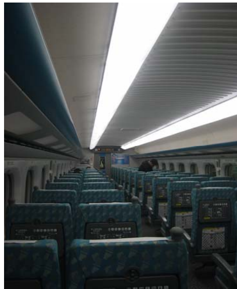
The inside of the bullet train.

The first day of our trip was hectic. We were all rushing onto the train, from Taipei, and we made sure that nothing was missing. Then we were all on the train (high-speed rail) for two hours. TWO!! It was really boring. Did I ever tell you that we were going to Tainan? Well we were and it was a long and boring trip. After two long hours, we finally reached our destination, Tainan. As we were getting off, (some