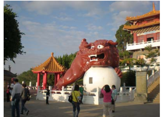
Lion at the Wen Wu Temple