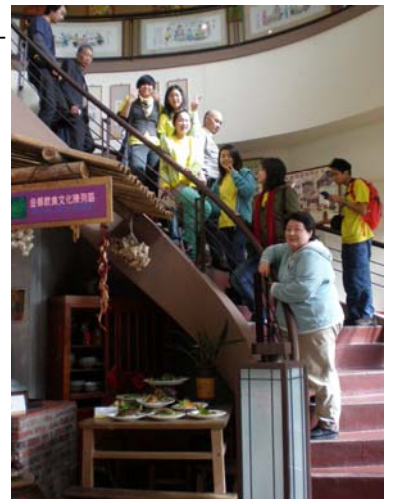
Everyone posing at he Pu Li restaurant .

one of the most exhausting day of the week.