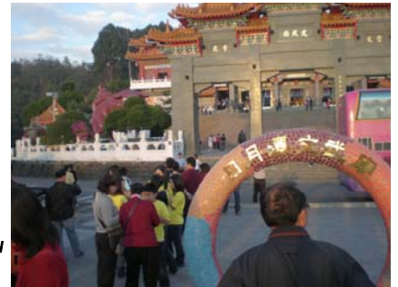
Another picture of the Wen Wu temple →