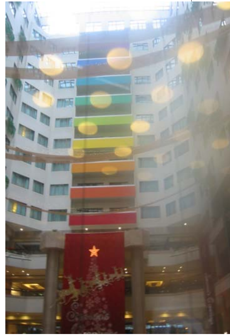
The beautiful scene inside the Howard Hotel

dents the following day. While at the Wen Wu temple we bought sausages and feeding the dogs. People also tapped on the water for good luck. The day was