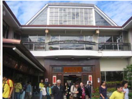
← outside of the Pu Li restaurant