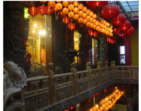
Beautiful lanterns in Kaohsiung Temple