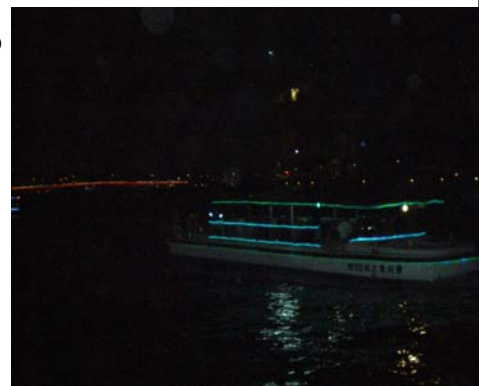
A boat cruising along Love River.