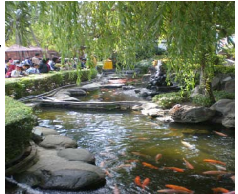
The fish in the pond of Zheng Chen Gong