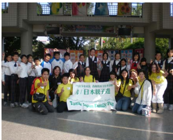
We were welcomed by some cool kids!

It was December 25th, 2008: Christmas Day. We woke up early to first enjoy our tour. At around one in the afternoon, we started driving towards the school. There, kids were lined up in their uniforms and clapped a beat together, greeting us. Some kids looked like they didn't want to be there. After that, we went upstairs to a room of six graders. We were all quite out of breath since we were already late. The sixth graders were a class of more advanced English learners. When we taught them, they seemed very mature. First, we asked them what they did for Christmas and after, we told them what an average American Christmas was like. We sang "We Wished You a Merry Christmas," then we had