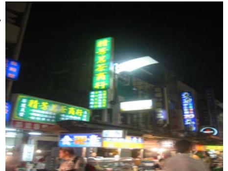
Blurring lights of the Night Market