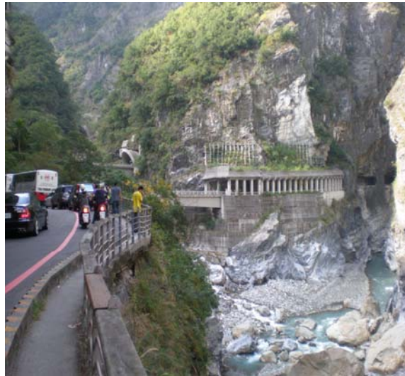
National Mountain Park in Hua Lian.

Today, we traveled to visit one of the amazing sights in Taiwan, the national mountain park in Hua Lian that is quite famous actually. We visited many different rock formations and learned that some of them are actually marble!!! Not only did we learn about marbles, we learned about the past history and how the mountain changed shape a lot and etc (especially after the 9/21 earthquake that happened a few years ago in Taiwan). There were many different