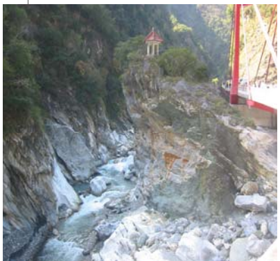
The frog rock said to give the bridge builders at the time, nightmares.