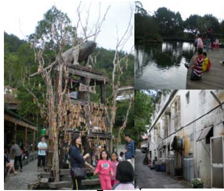
The wishing tree, alleyways, and lake of clam and peaceful Tou Chen Farm

"Ma-La-Su" (means 'How are you? Aloha!') -from the Natives in Taiwan