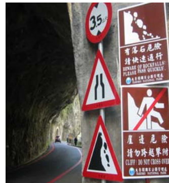
Caution signs along the trail.