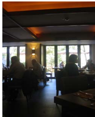
The dim lighting at the buffet at Formosa Hotel