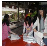
Lets work on leaf press on prints!