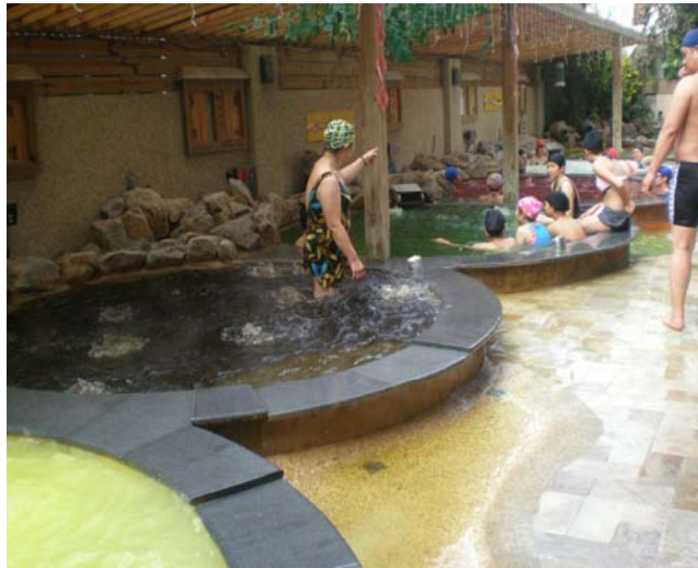
Here you can see the egg, meat, tea, rose, and milk pools from left to right.

ing swimming caps and looking bald wasn't as bad as some imagined. As long as everyone was wearing it, it didn't feel that strange, no. We were awed by the kiddie playground, which by the