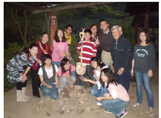
Everyone celebrates the accomplishments of making an old fashioned stove.