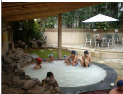
AWESOommEE~~ They have a milk pool! ... Smells like milk by the way >W<

rush and panicked blur. Everything from the beginning of the hot spring visit to the end was so fun.