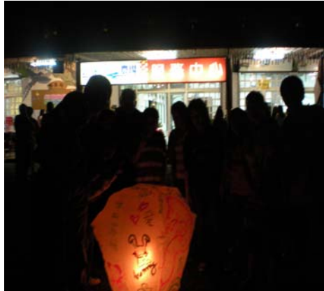
Everyone ready to lift off a lantern!!